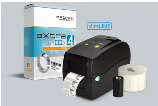
Fig.3 The eXtra4 range: Labelling systems from a single source