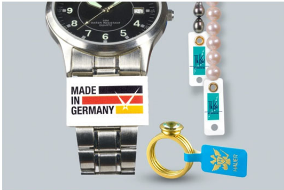
Fig.1: Brand labels with customised logo from eXtra4 production